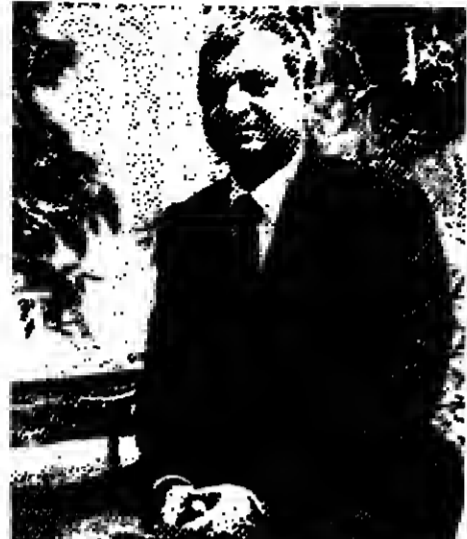
Afghan President Babrak Karmal